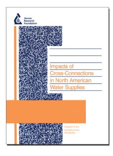
The Executive Summary of the Report reads:

he Foundation completed a study for the American Water Works Association Research Foundation (AwwaRF) in 2002 entitled, "Impacts of Cross-Connections in North American Water Supplies." Although the study was completed some time ago, AwwaRF only made the report available to AwwaRF subscribers. It has now become available to the general public through IWA Publishing.